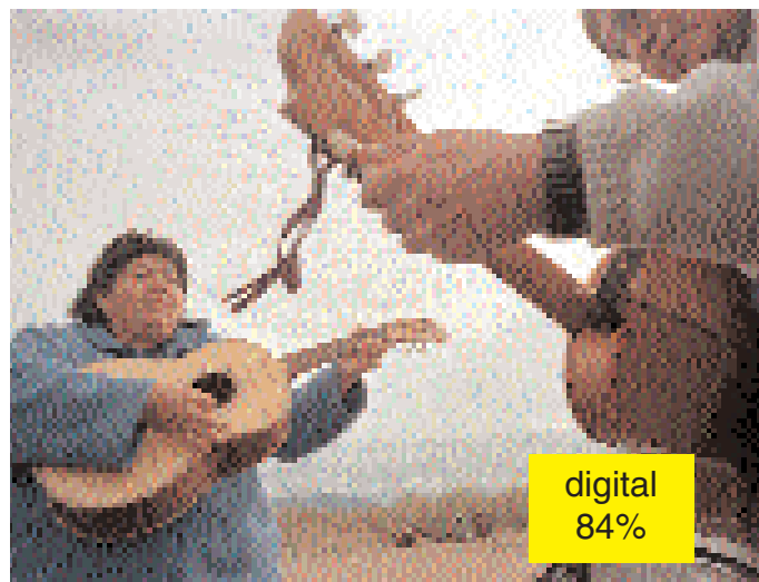
Choir members prepare to sing on an anniversary of the death of a Tohono O'odham tribe member at his home.