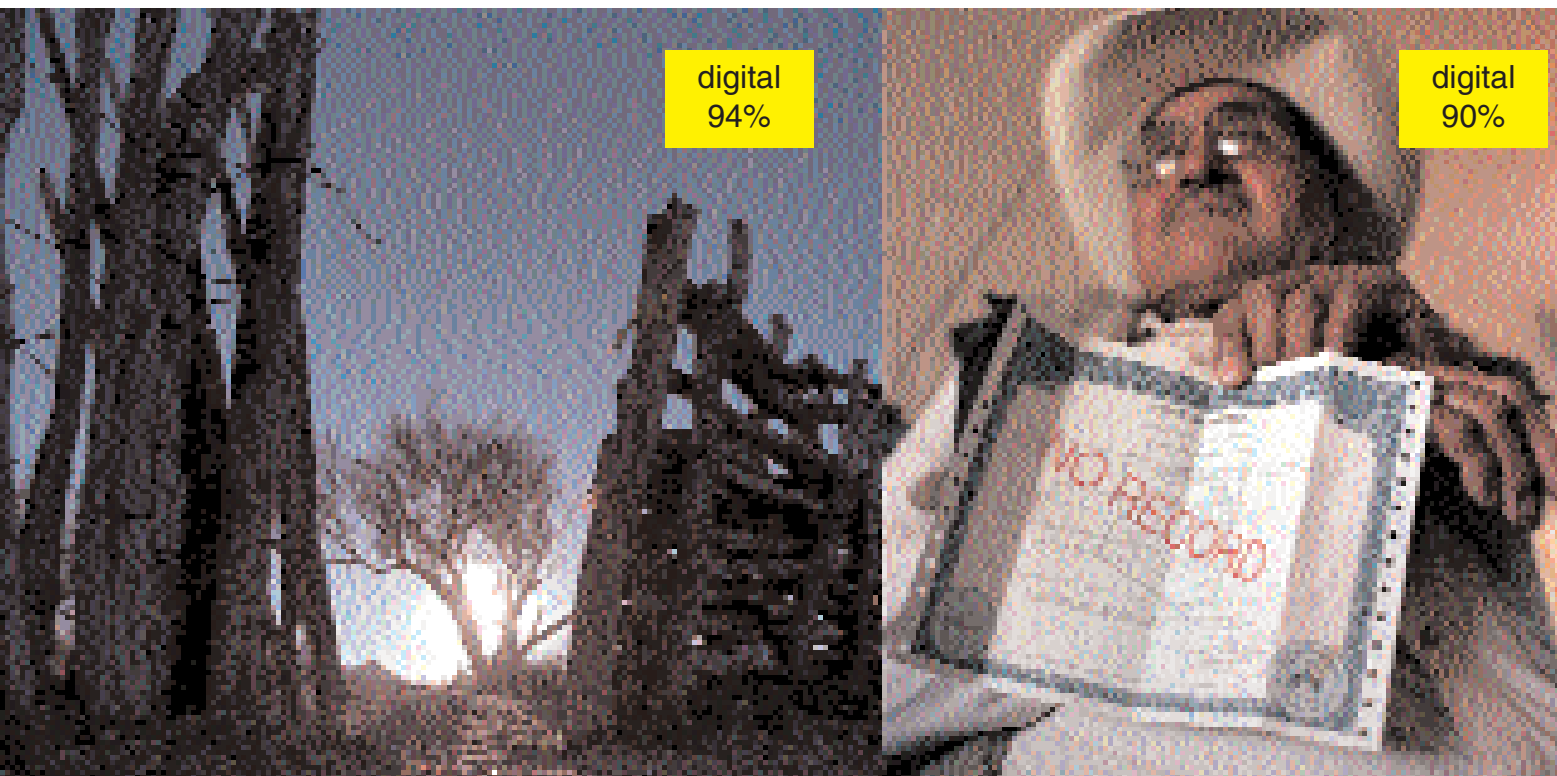
A corral on an old ranch (left) marks the border between the United States and Mexico, a crossing point for the Tohono O’odham before the recent clampdown. This tribe member (right) unsuccessfully tried to document his birth in the United States.